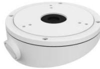
1281ZJ-M Inclined Ceiling Mount